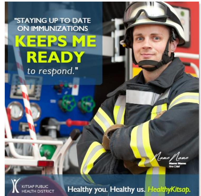
Mockups of campaign materials.

Paid media featuring Kitsap healthcare providers and other trusted community leaders sharing affirming statements about immunization