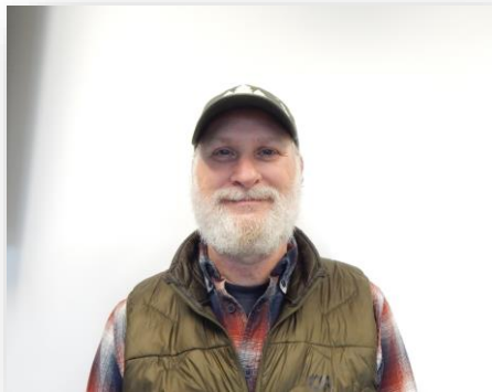
Tobbi 7 years