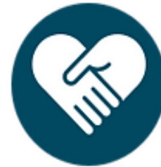
Mental & Behavioral Health