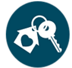
Housing & Homelessness